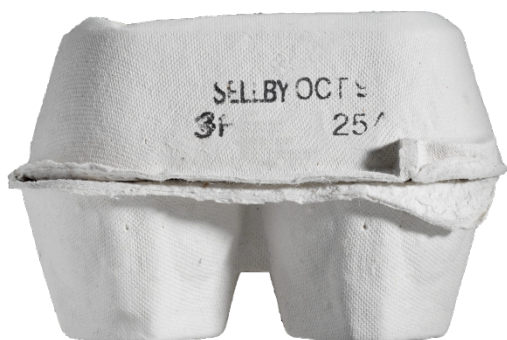
Producer code has been removed for anonymity

Contact marking systems aren't easy to change the information being coded on the carton, and they are difficult to reconfigure if a new layout is required. They also don't indicate when they are running low on ink, or when they might have a printing problem. If employees don't check, consumers will become the quality control point.